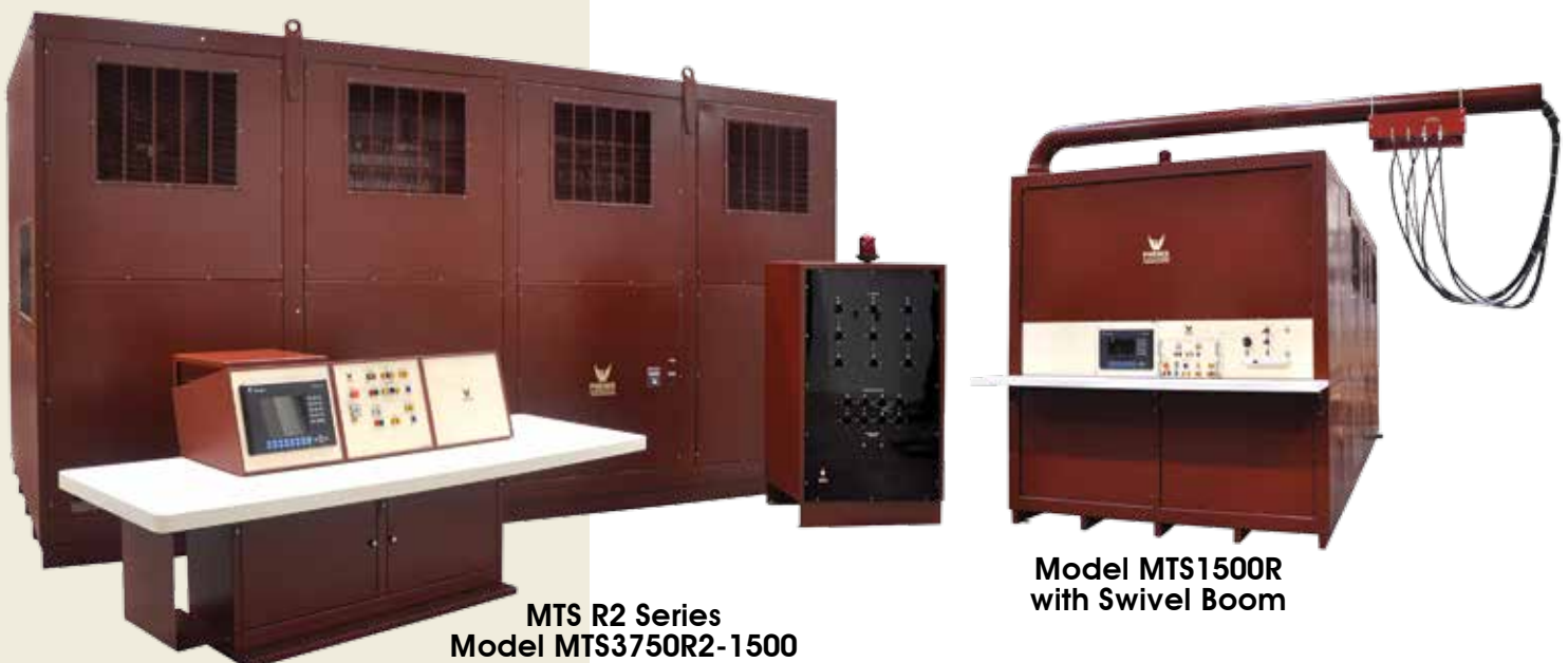
MTS R2 Series Model MTS3750R2-1500