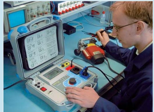
Final test on a portable appliance in a service workshop