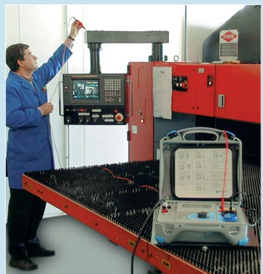
Complete testing of safety on machines (at initial installation or on periodic basis)

Automatic test: One-man operation by remote probe