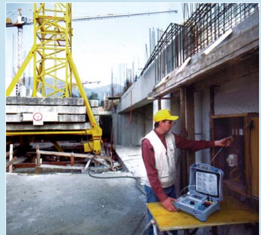
Testing of safety in a construction site on a switchgear