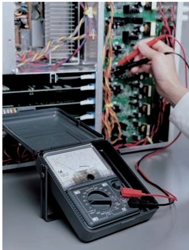
Carrying handle of the supplied case becomes a stand.